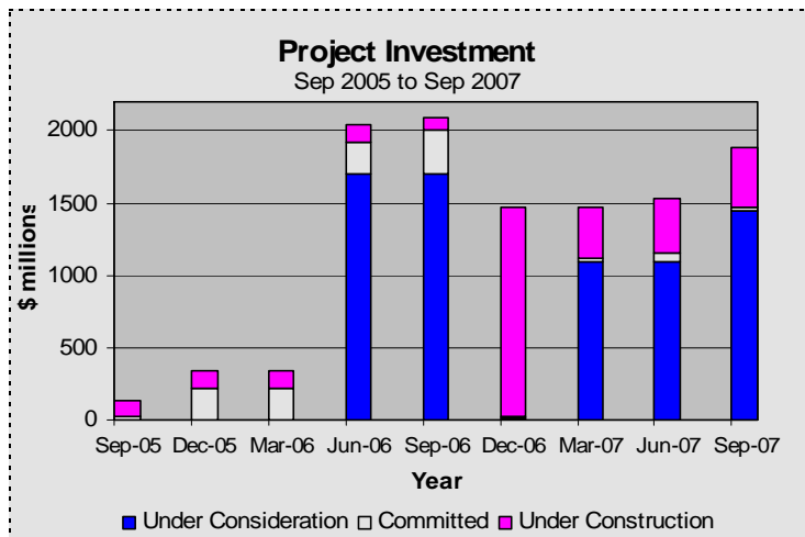
Source: Access Economics Investment Monitor, September 2007

Project Investment is a barometer of structural change in the Western Australian economy, and of the investment climate, now and in the future. In general, it covers private and public non-residential building, such as transportation, mining, manufacturing and infrastructure projects.